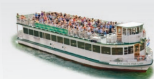
CHICAGO'S FAIR LADY