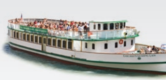
CHICAGO'S LEADING LADY