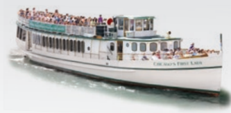
CHICAGO'S FIRST LADY