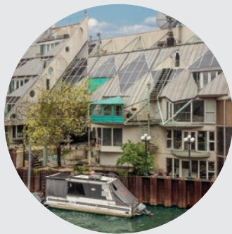
HARRY WEESE COTTAGES