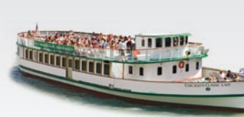
CHICAGO'S CLASSIC LADY