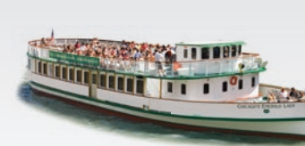
CHICAGO'S EMERALD LADY